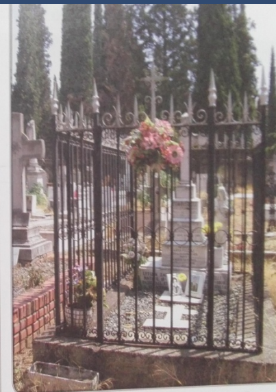
Καθολικός τάφος του Αρχιτέκτονα Vitaliano Poselli (ήταν ο αρχιτέκτονας του κτιρίου του Υπουργείου Βορείου Ελλάδας, σήμερα ΥΜΑΘ).