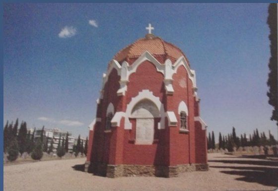
1ος Παγκόσμιος Πόλεμος 1914-1918. Παρεκκλήσι στο Γαλλικό Τομείο, στο χώρο βρίσκονται ενταφιασμένοι 8.089 στρατιώτες (Γάλλοι, Σενεγαλέζοι, από τη Μαδαγασκάρη, Αλγερινοί, Βιετναμέζοι, Ισραηλινοί και Έλληνες, όλοι κατατάγμενοι στον Γαλλικό Στρατό).