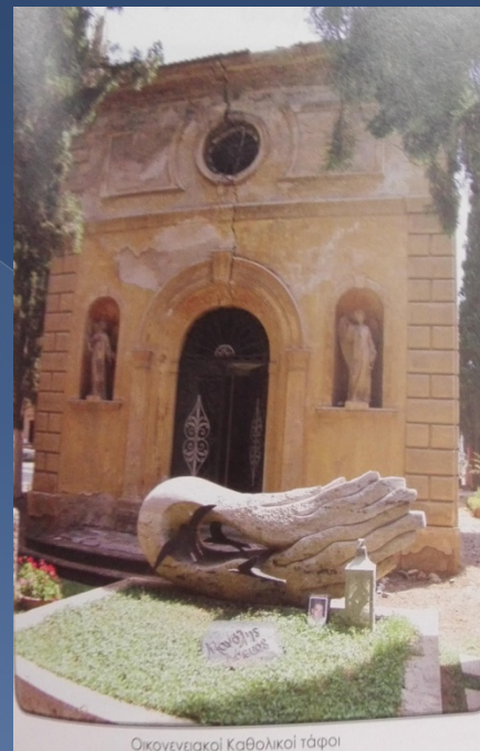
Οικογενειακοί Καθολικοί τάφοι